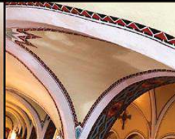
Water staining in plaster