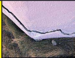
Structural stucco cracks