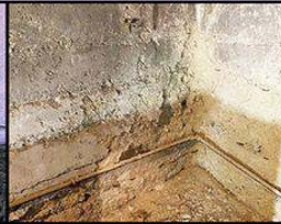
Basement wall deterioration