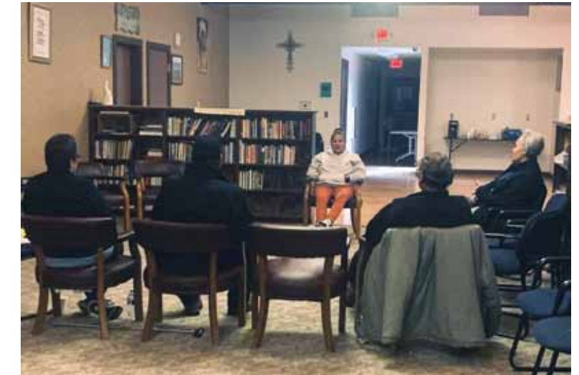
By sharing their stories in regular meetings, people in recovery learn from each other, and they discover they’re not alone.

I wanted to have open recovery meetings because we are all recovering from something, from drugs and alcohol to trauma and depression. As a group, we would like to do things for the youth and communities. Things like feeding the hungry or a Christmas dinner, youth fishing derby...[things that give people] something to look forward to.