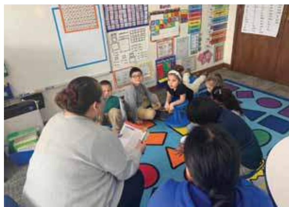
President, St. Francis Mission